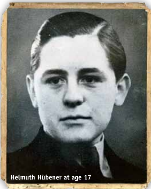
Helmuth Hübener at age 17

In the final days of World War II, Hitler committed suicide to avoid