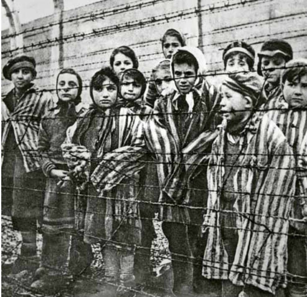
This 1945 photo shows children at Auschwitz, one of six death camps the Nazis built. Between 1933 and 1945, the Nazis murdered more than 6 million European Jews. Many were murdered in camps like this one. Catholics, Jehovah's Witnesses, Gypsies, gay people, and other groups the Nazis considered "inferior" were also murdered. This mass killing would later be called the Holocaust.