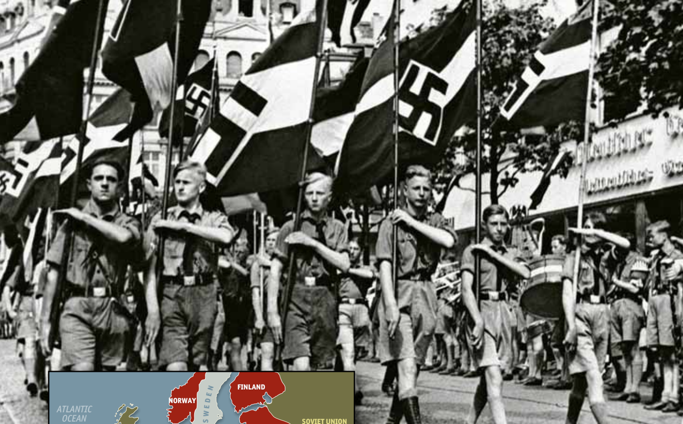
Above: The Hitler Youth march in a Nazi rally in Nuremberg, Germany, 1933. At the beginning of 1933, the Hitler Youth had 50,000 members. By 1936, membership had increased to 5.4 million. Left: This map shows Europe in 1942. What can you conclude about Nazi Germany?